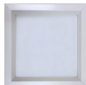
Various Sized Lite Kits Optional